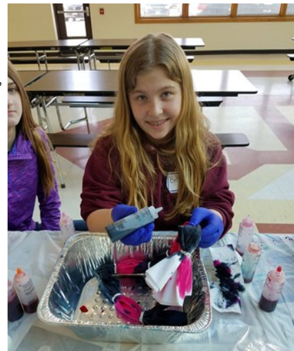
Tie-Dying at Project Day

To all our participants, thank you so much for coming and we hope to see you again next year!